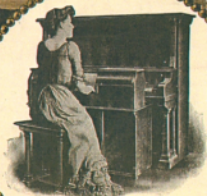
STERLING CABINET PLAYER AND PIANO