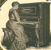
COMBINATION STERLING PLAYER PIANO TWO in ONE

PUBLISHED BY THE STERLING PIANO CO BROOKLYN, NEW YORK. COPYRIGHTED.