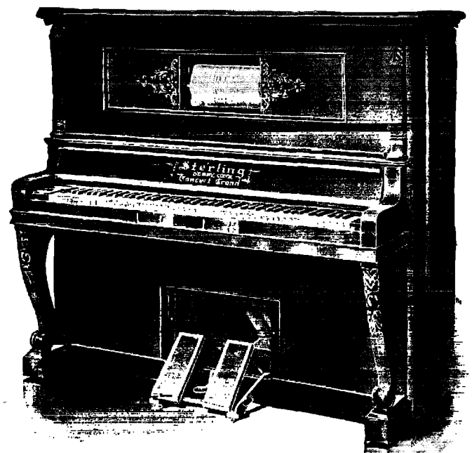
Sterling Playerpiano, Opened