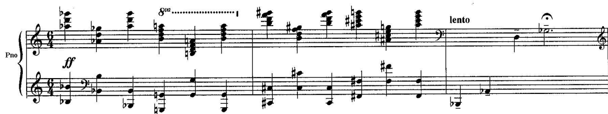
Ex. 3.8 -Vargas, Concerto, I mvt., mm. 116-118

The use of B b as the pitch center from this point on will prepare the retransition to the key of E b .