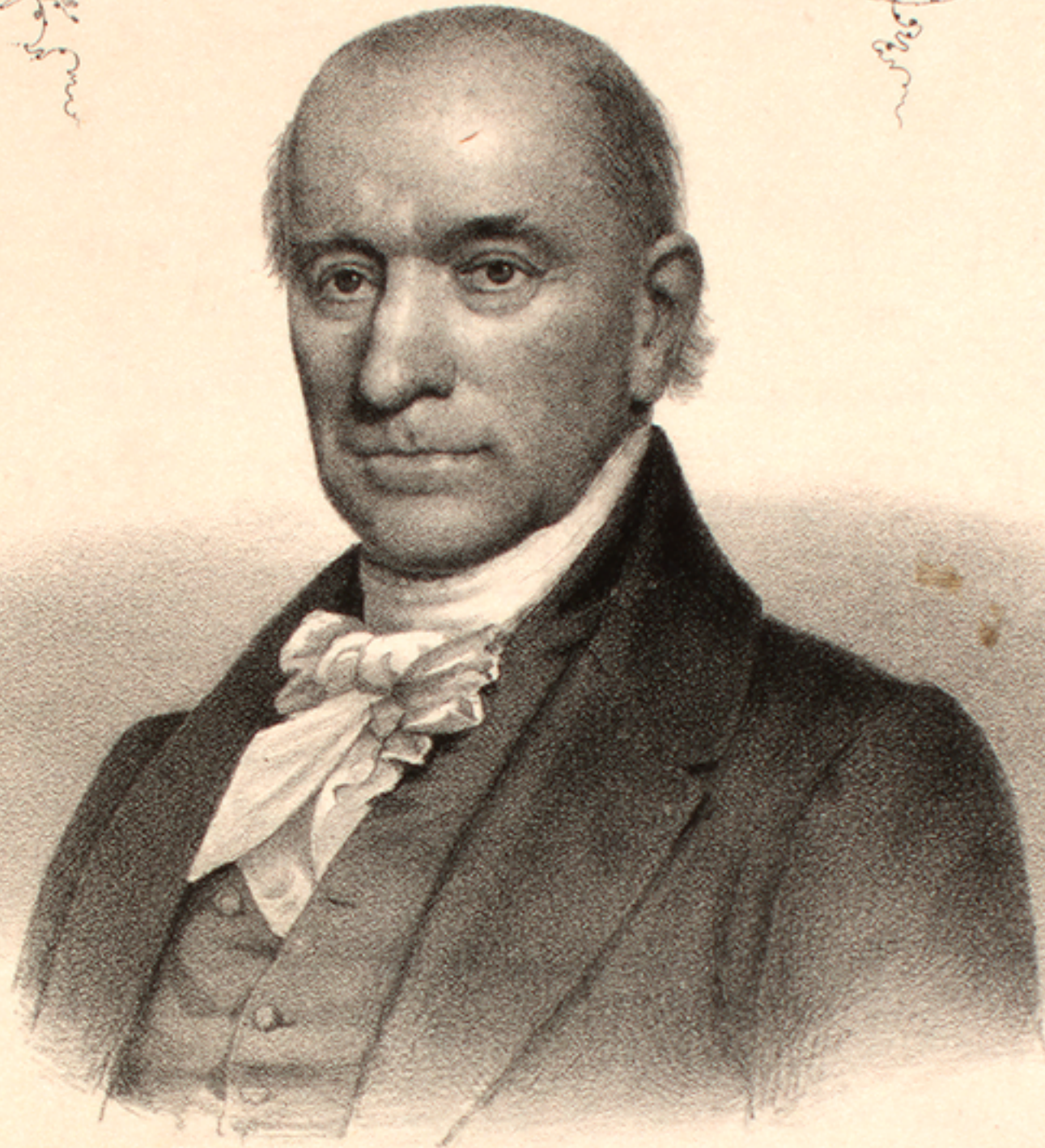
Tappan & Bradford's Lith.