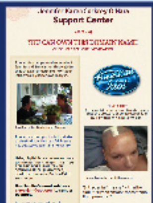
A Web site was started to help raise money